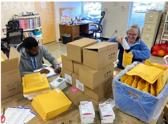
Hanover County Community Services Board staff preparing a large order of Naloxone by Mail packages