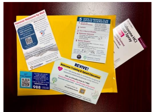
Contents of a Naloxone by Mail package

The Naloxone by Mail Program launched on January 7, 2025 , through collaboration between the Hanover Community Services Board, the Chickahominy Health District, and the Hanover Opioid Task Force. The program was modeled after a successful initiative in another Virginia locality and adapted to meet Hanover’s needs. Oversight of the project is provided by the Hanover County Opioid Task Force, a community coalition focused on the opioid overdose epidemic affecting Hanover County. Current funding for the initiative is provided by Medication-Assisted Treatment (MAT) funds coordinated through the Hanover Community Services Board. Each partner has a defined role in the implementation process, from coordinating the resident requests to mailing the packages. This ensures that when the naloxone arrives at a household, it includes naloxone nasal spray (2 doses), step-by-step overdose response instructions, information on recognizing an opioid overdose, and information on virtual REVIVE! Naloxone Training and Opioid Education.