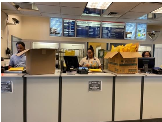
At a local USPS office mailing out a large batch of Naloxone by Mail packages

In terms of cost efficiency, each kit costs approximately $7.05 . This demonstrates that the program delivers significant public health impact at minimal cost , making it highly scalable.