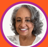
Daphne Maxwell Reid ARTS & CULTURE