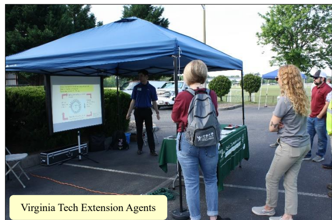
Virginia Tech Extension Agents

Additionally, Virginia Tech Extension Agents provided education on poisonous plants and bugs commonly encountered in the field, while the Peninsula Health District addressed tick, mosquito, and animal bite prevention. These presentations are particularly critical for outdoor crews who routinely work in variable environmental conditions.