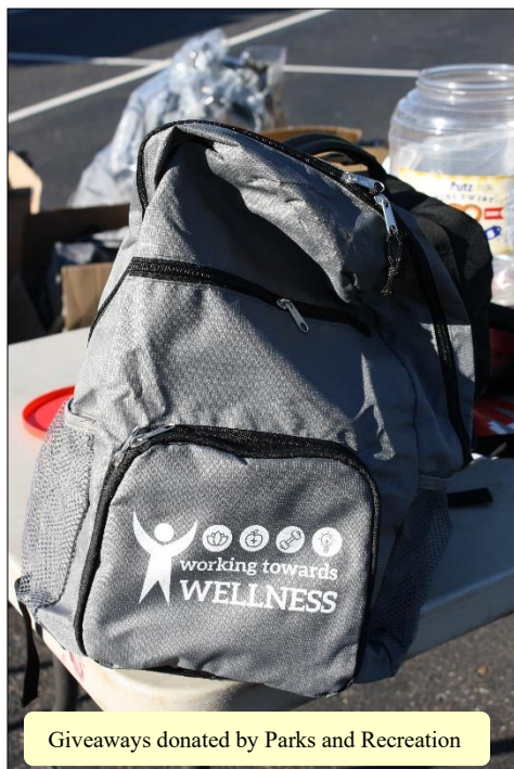
Giveaways donated by Parks and Recreation

James City County's (JCC) Safety Rodeo Program (Program) is a standout example of intergovernmental collaboration and innovative safety awareness designed to protect employees on the job. Launched three years ago by the County's General Services Department in partnership with the James City Service Authority (JCSA), with Wellness giveaways provided by the Parks and Recreation Department, the Safety Rodeo addresses comprehensive aspects of worker safety ranging from equipment operation and vehicle safety to environmental hazards and