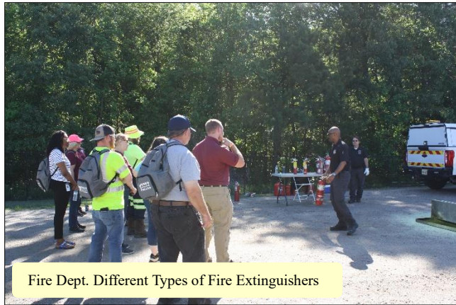
Fire Dept. Different Types of Fire Extinguishers

The James City County Fire Department demonstrated fire extinguisher use and provided participants with an opportunity to extinguish a controlled fire, reinforcing practical fire safety skills.