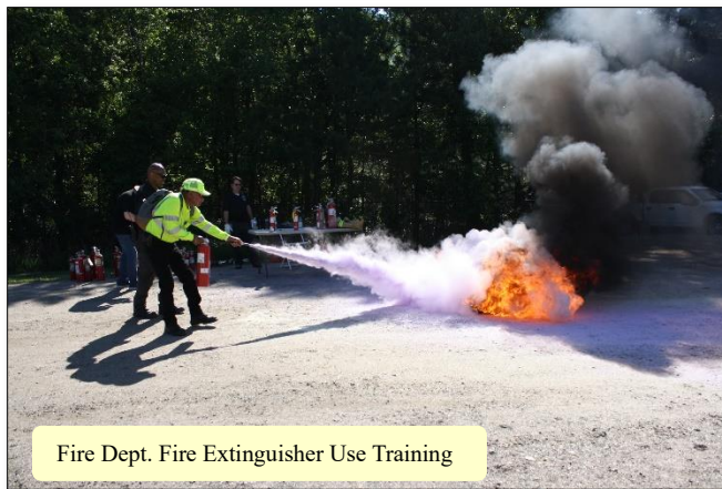
Fire Dept. Fire Extinguisher Use Training

The James City County Fire Department demonstrated fire extinguisher use and provided participants with an opportunity to extinguish a controlled fire, reinforcing practical fire safety skills.