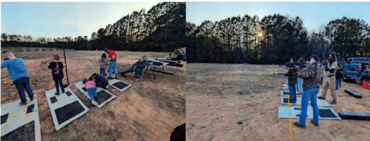
4-H Riflery Club practicing on their Shotgun/Rifle Shooting Range.