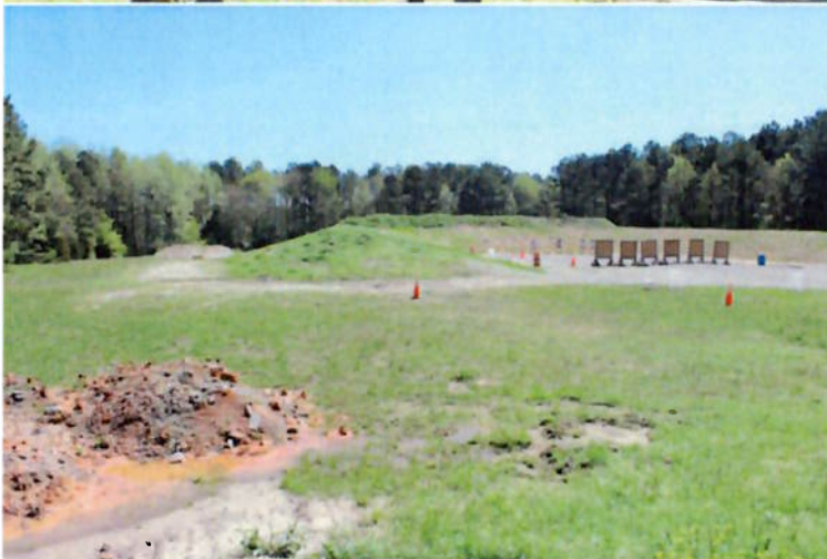
On the left is the long-range weapon area (berm can be seen in the distance). To the right is the main qualifying range. Both ranges may be used safely at the same time.