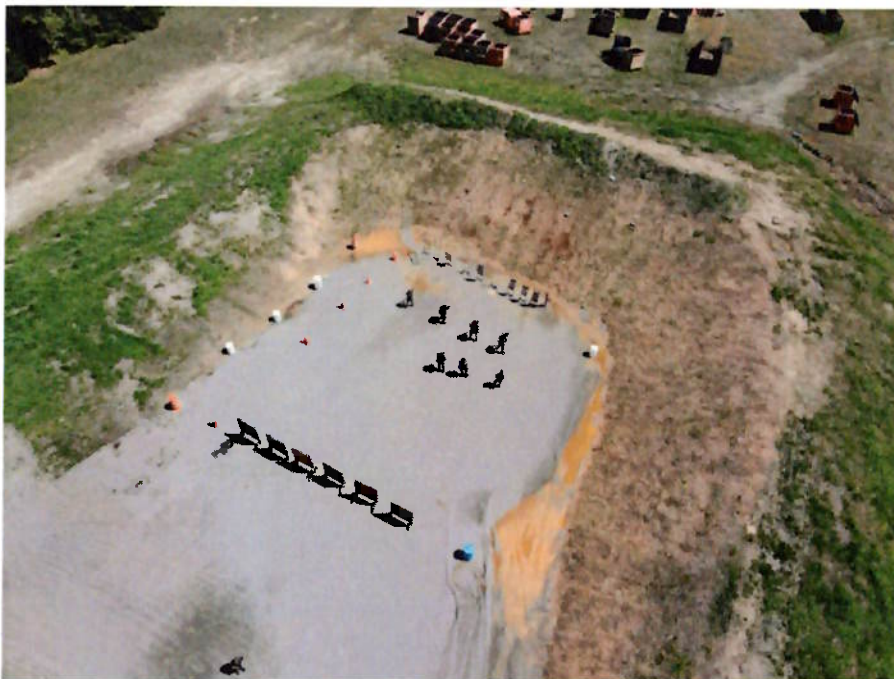
Aerial views of the DCSO Shooting/Qualifying Range.

Images captured with a DCSO drone during routine training.