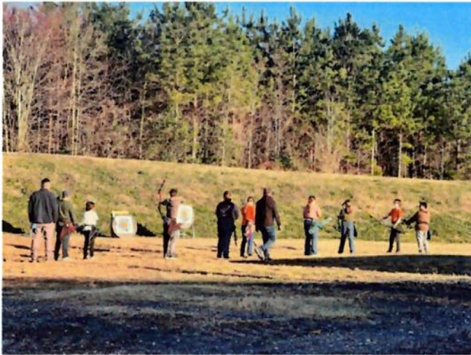
4-H Archery Club youth and volunteers enjoying the Archery Range.