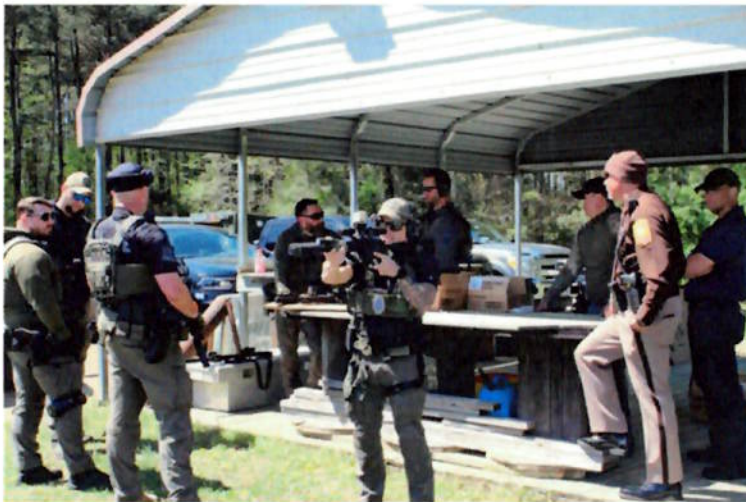
The Hopewell Police Department's Tactical Team preparing for practice on Dinwiddie's range.