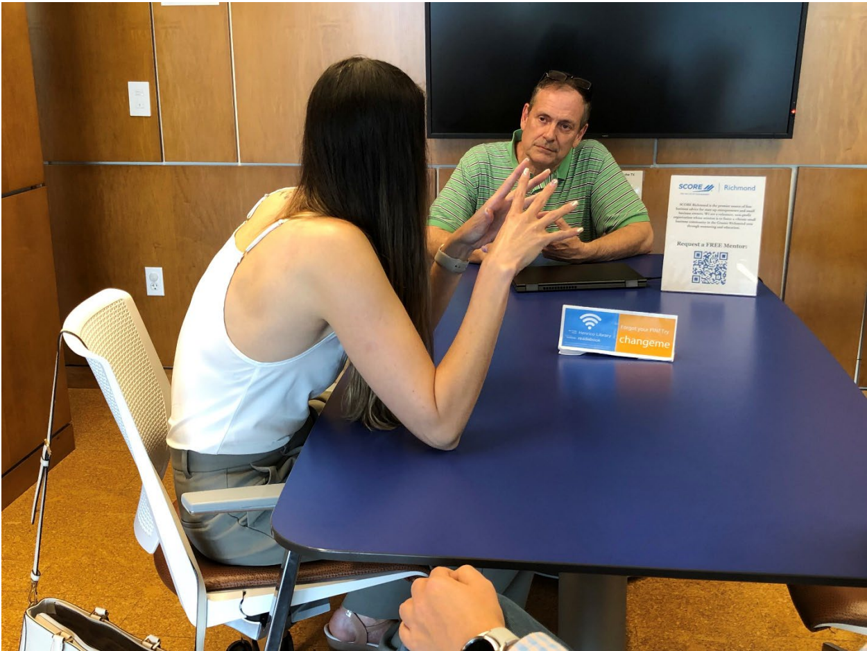
PUMP Session in action: