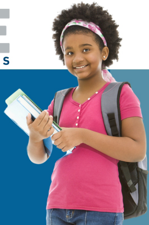
PHOTO SPEED ENFORCEMENT