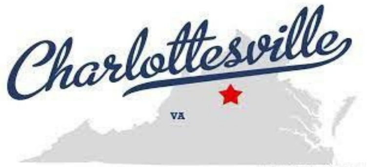
Designed by TownMapsUSA.com

Charlottesville was the home of two U.S. Presidents, Thomas Jefferson, and James Monroe. During their terms as Governor of Virginia, they lived in Charlottesville and traveled to and from Richmond. The University of Virginia, founded by Jefferson and one of the original Public Ivies, straddles the city's southwestern border.