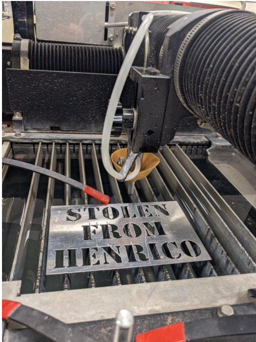
Picture of a template being manufactured on a waterjet.