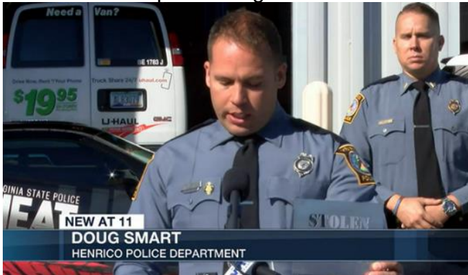
Picture of Henrico police department speaking to the media about the program and holding the template.

The link below will take you to an NBC12 story regarding the overall program. Channel 12 Program Story