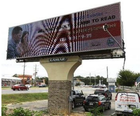
Photo of billboard advertisement for National Adult Education and Family Literacy Week on electronic billboard located near a major intersection in Chesterfield County.