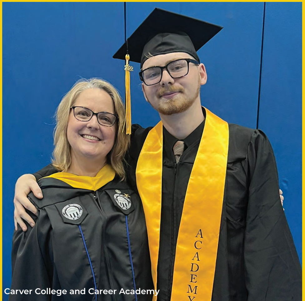
Carver College and Career Academy

Alongside Chesterfield County Public Schools, Communities In Schools of Chesterfield spent the past several weeks gearing up for the new academic year and helping the 11 school sites they support welcome students to school. A big part of that effort included collecting much-needed school supplies for students who were not able to bring their own. That included participating in the regional Ultimate Backpack Drive, an annual school supply drive. It was a day when the community rallied to donate school supplies, and hundreds of volunteers filled