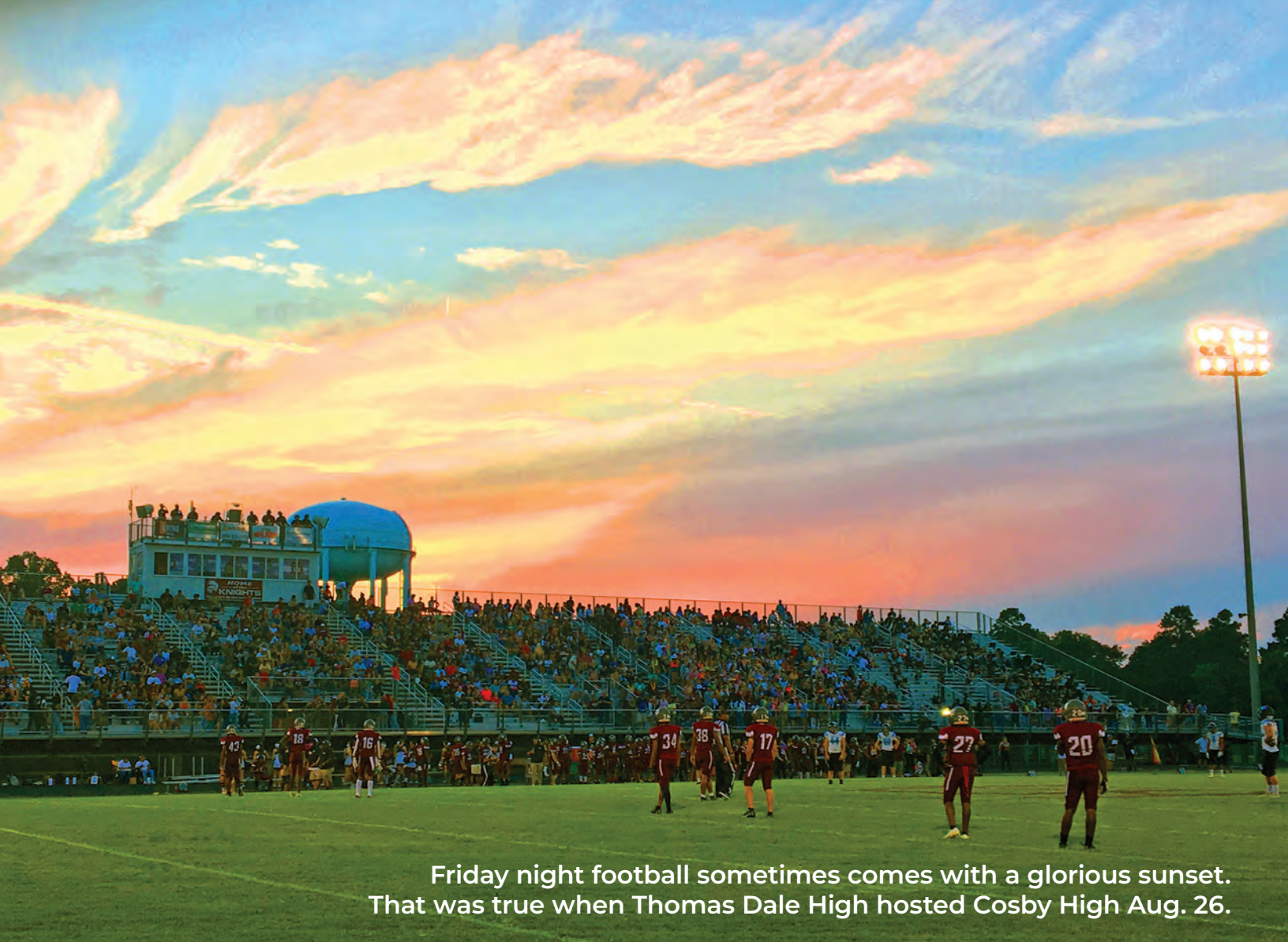
Friday night football sometimes comes with a glorious sunset. That was true when Thomas Dale High hosted Cosby High Aug. 26.