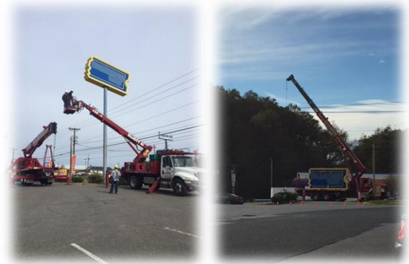
Before and after photo of the Blockbuster sign being removed

The Committee was able to have two abandoned signs removed along the business corridor through a collaboration with the Community Development Office, Commercial Steel Erection (CSE), and property owners. The first sign removed was an old blockbuster sign that was taken down through enforcement by the County's zoning ordinance. The removal of the sign helped the property owner fill the vacant storefront with a new business a few years later. The second sign removed was an old Exxon sign located along the corridor. The property owner agreed that the sign should be removed and CSE, without charge removed the sign pro-bono.