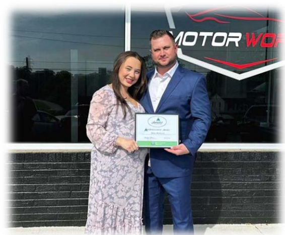
Motor World Receiving the A+ Improvement Award

share the vision of the committee to create a welcoming and attractive corridor for our citizens, guests, and potential new businesses. The Committee selects a new business to recognize each quarter of the calendar year, in which their acknowledgment is recognized by a certificate and write-up in the local newspaper.