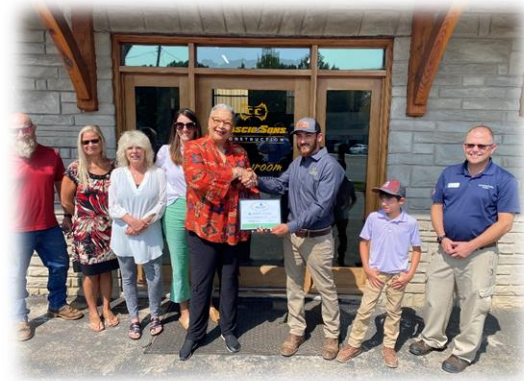
Cascio & Sons Receiving the A+ Improvement Award

The A+ Improvement Award, founded in 2023 by the Committee, recognizes businesses along the corridor that have made improvements and investments in the aesthetics of their property. This award provides the Committee an opportunity to positively acknowledge the