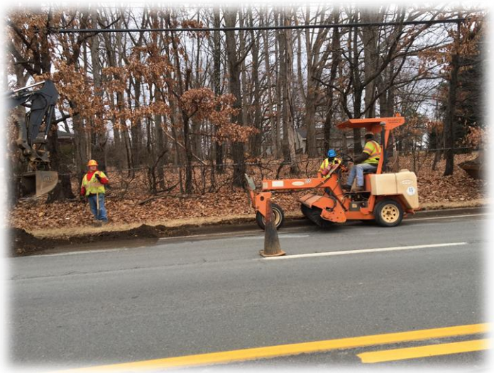
VDOT Street Sweeping 12 miles of Route 29 Business

A major obstacle the Committee identified in trying to beautify the corridor was the grass-cutting and street sweeping maintained by VDOT. Prior to the Committee identifying these areas of concern, VDOT was cutting grass areas along Route 29 Business four times a year and street sweeping happened maybe once a year if funding allowed. The Committee