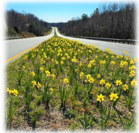
Blooming Daffodils along Route 130

project. The project was a group effort among Community Development, Public Works, the Economic Development Authority, the Amherst County Sheriff's Department, the Route 29 Business Beautification Committee, volunteers, and the Virginia Department of Transportation.