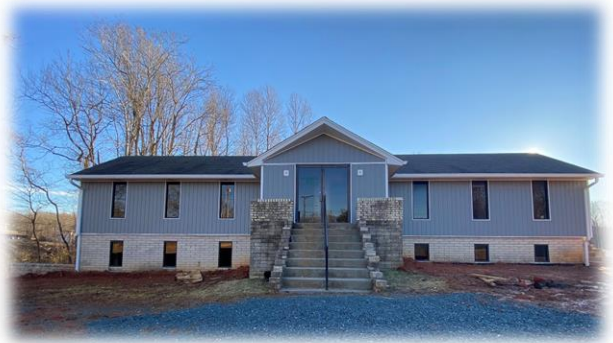
Before and after picture of an approved mini-grant submission