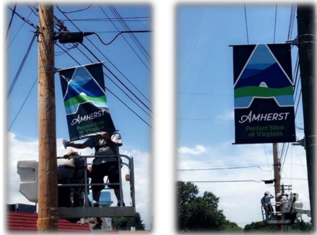
County Banners on AEP poles

Alongside the same time as the tree plantings, the Committee proposed raising banners with the County logo along the corridor and Riveredge Park. Through a partnership with American Electric Power (AEP), 71 electric poles were identified to allow County banners