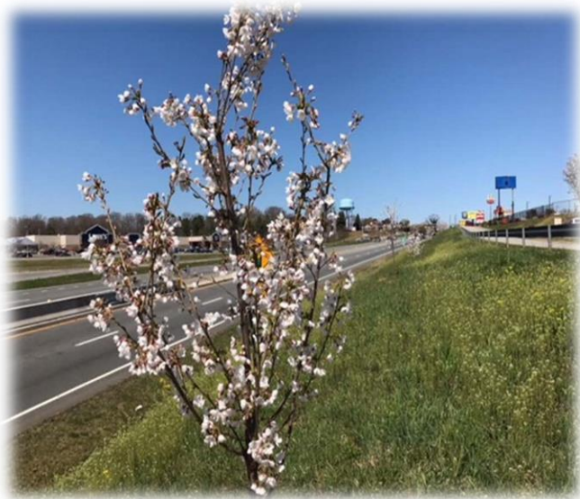
Yoshino Cherry tree blooming on Route 29 Business

Community Development came to fruition. Roughly, 120 trees were planted along the business corridor; the species included Sugar Maples, Red Maples, Yoshino Cherry, and Crape Myrtles. Then, in the spring of 2021, the Committee collaborated with Amherst County Public Works and Community Development for the replacement of 16 trees. In