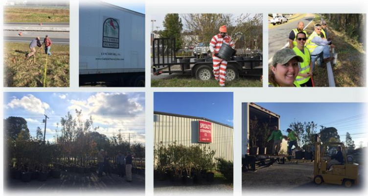
Assortment of pictures taken from the tree planting

In 2018, a joint effort with several months of planning between the Committee, Virginia Department of Transportation, Amherst County Public Safety, Public Works, Sheriff's Office, and