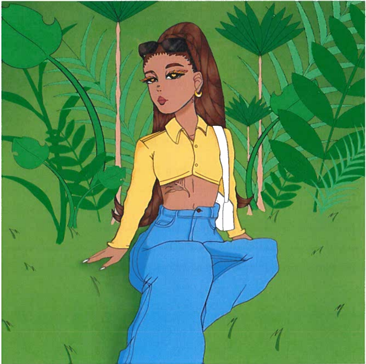
Artist: Ashal Khan