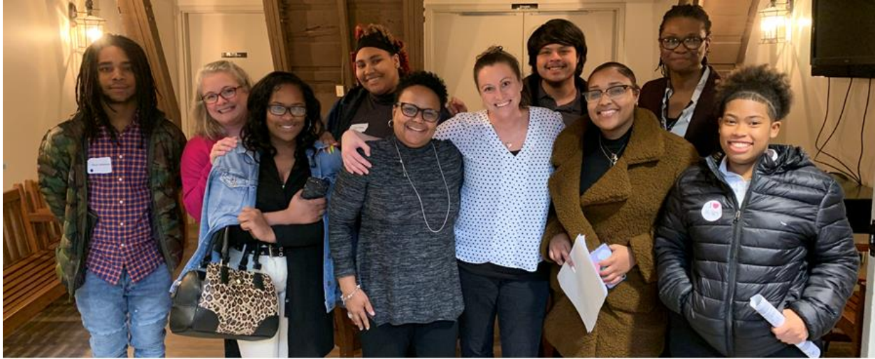
Some student and teacher participants