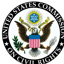
US Commission on Civil Rights