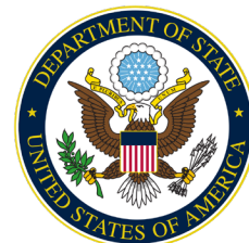
U.S. Department of State