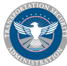
Transportation Security Administration