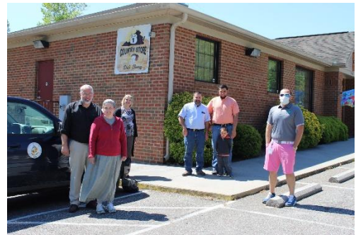
Route 1 Country Store