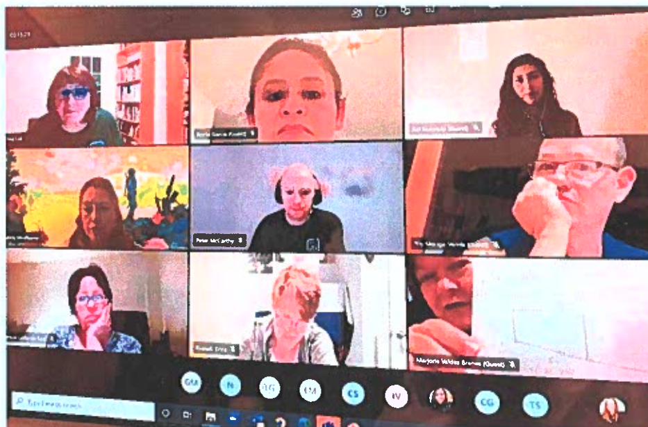
Figure 2. Screenshot of Virtual Curso Básico CERT Participants

Graduates will be able to volunteer to assist the County in emergency response, including staffing pandemic response events like COVID-19 testing and vaccination clinics.