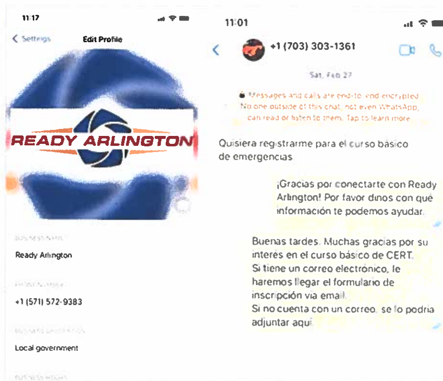
Figure 6. WhatsApp Inquiry about Curso Básico CERT