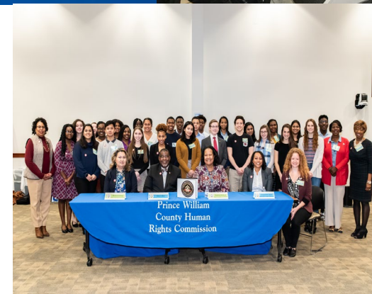
Students pictured with the community leaders who served as panel members for the "Me Too Movement" discussion.