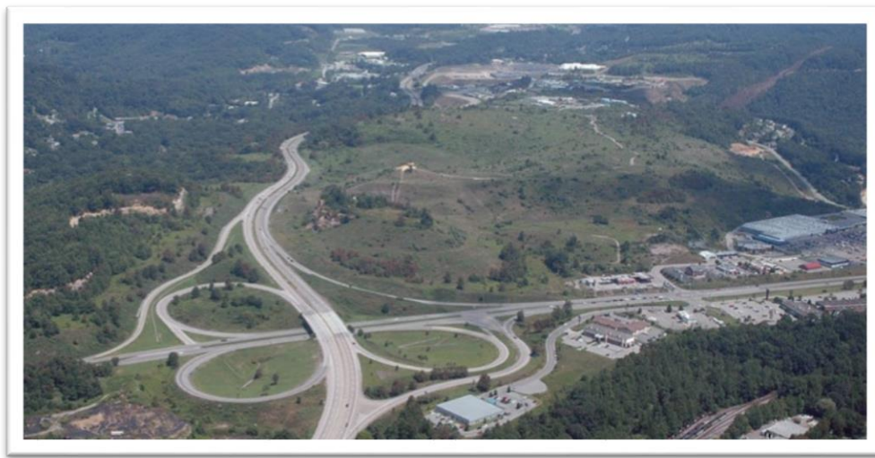
Figure 3 Project Intersection Site Norton Virginia

The Project Intersection site has been identified by two independent studies-the LENOWISCO PDC Site Selection Study (2011) and the Virginia Coalfield Economic Development Authority Regional Site Selection Study (2016). Both studies concluded that the Project Intersection site is one of the best sites for development of regional economic development in the entire Coalfield Region. The Project Intersection site is immediately adjacent to the heaviest traveled, highest cumulative non-interstate