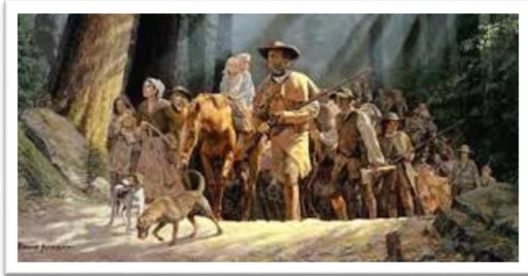
Figure 2. Daniel Boone traveling through the Cumberland Gap

Not a new concept. A Historical Perspective.