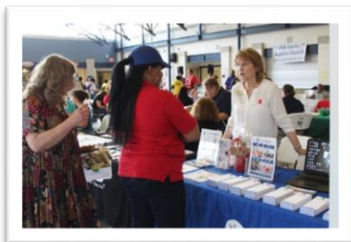
Representatives from local agencies and non-profits spoke directly with patrons about resources available in the community.