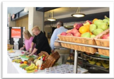
School nutrition staff provided an array of fresh fruits and vegetables for sampling.