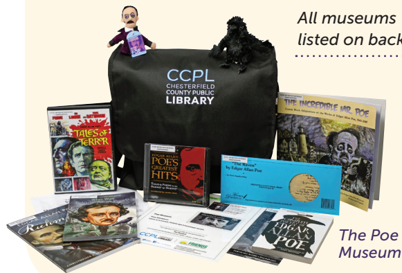
The Poe Museum