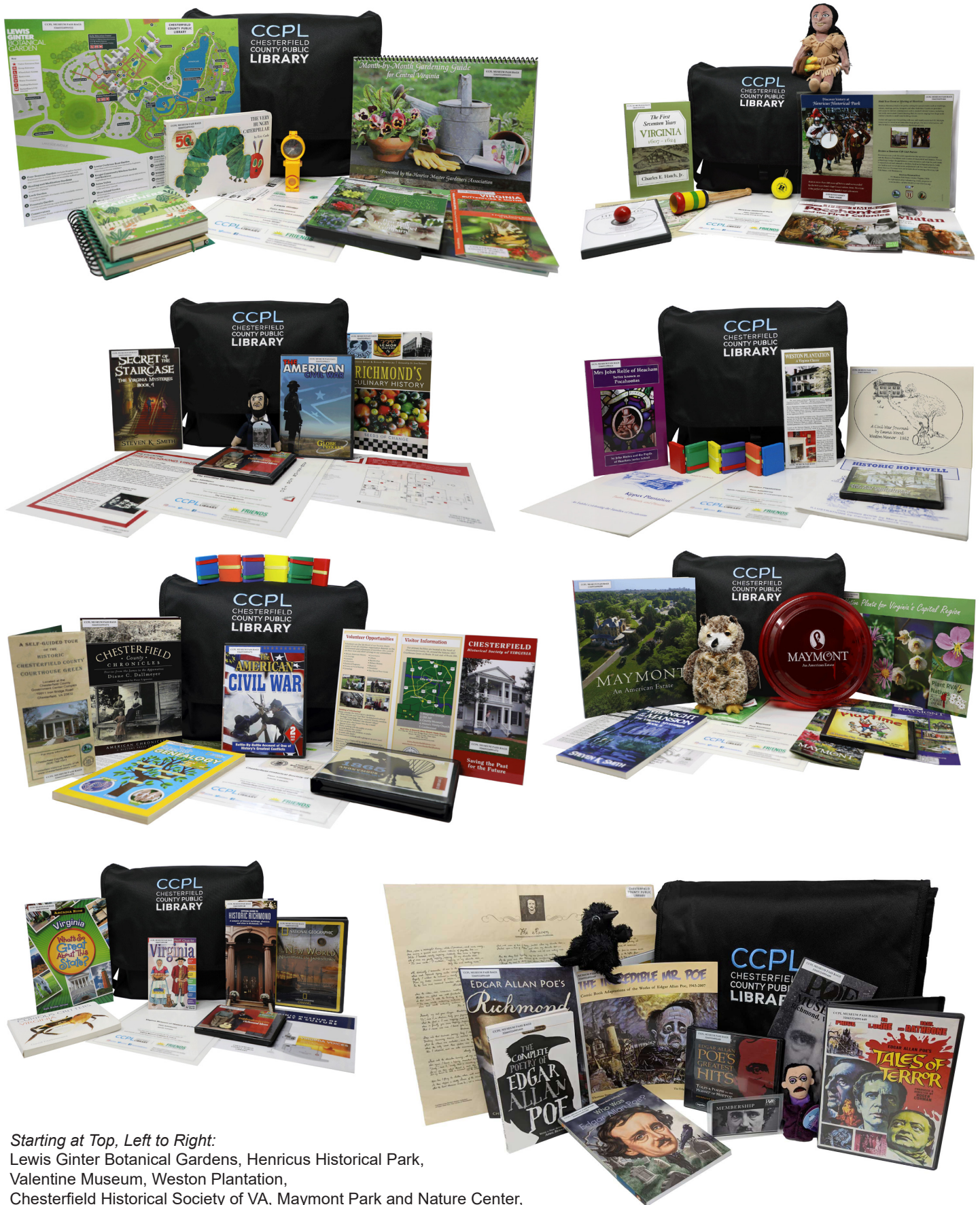
Starting at Top, Left to Right: Lewis Ginter Botanical Gardens, Henricus Historical Park, Valentine Museum, Weston Plantation, Chesterfield Historical Society of VA, Maymont Park and Nature Center, VA Museum of History and Culture, Poe Muesuem