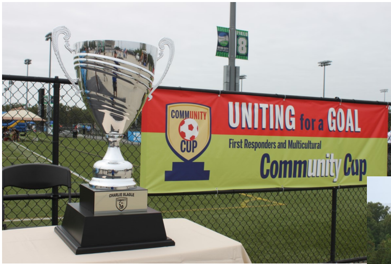
CommUNITY Cup September 14, 2019 River City Sportsplex Chesterfield, VA