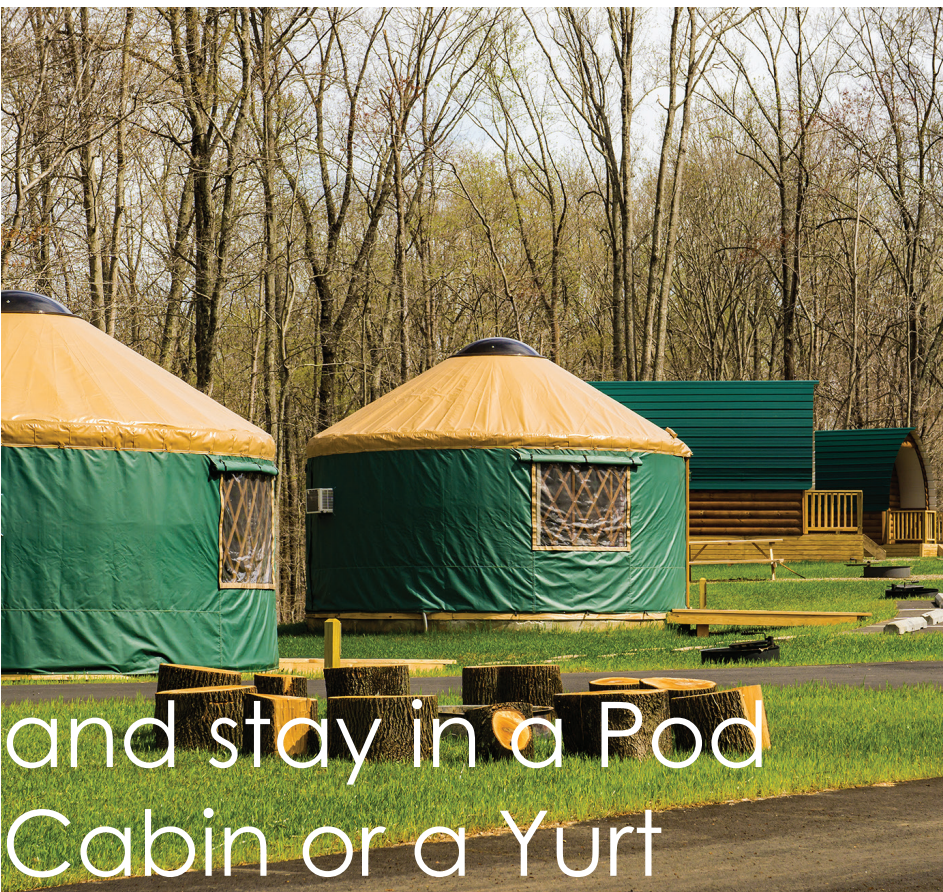
and stay in a Pod Cabin or a Yurt