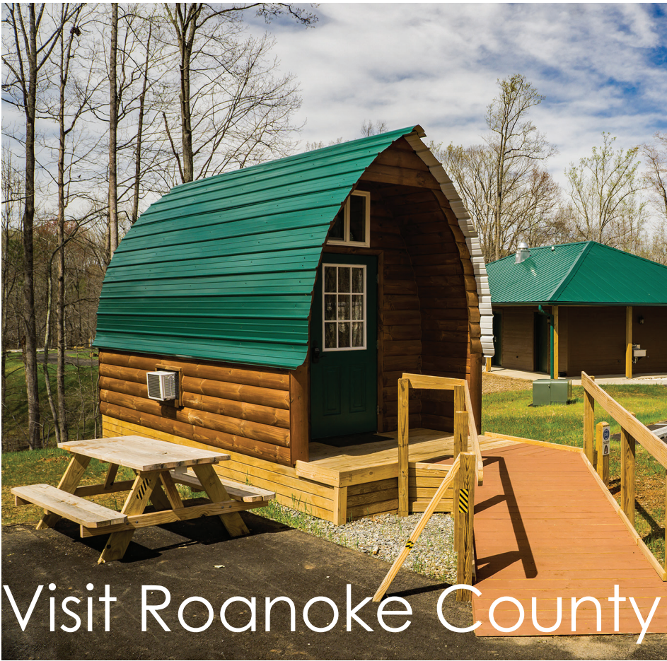
Visit Roanoke County

One of the great treasures of Virginia's Blue Ridge is Explore Park, an 1,100-acre destination at Milepost 115 of the Blue Ridge Parkway and situated along the Roanoke River in Roanoke County. Many people enjoy mountain biking (even with kids), some enjoy a stroll along one of the trails, and still others visit for the historic buildings. Shucks, some are so smitten with the park that they discover it's the perfect setting for a wedding.