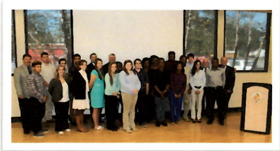
Student participants with County leaders.