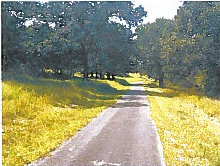
While there is a pond and a picnic pavilion, the main attraction of the Trails at Mill Place is the two-thirds-mile walking trail.