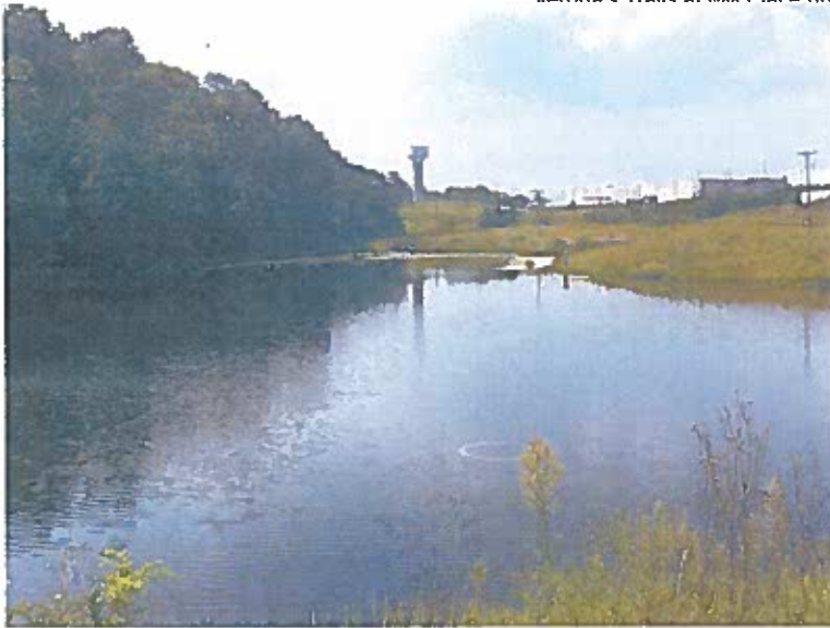
In addition to the walking trail, there is pond at the Trails at Mill Place that's available for fishing.