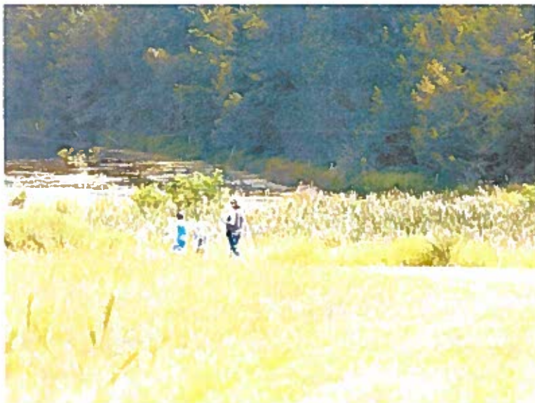
The two-thirds-mile walking trail is already being used by families in the Verona area.