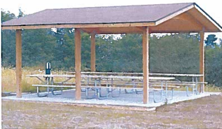
In addition to a walking trail and pond, there's a picnic pavilion near the parking lot of the Trails at Mill Place.

"Probably not in my lifetime," he said, "but I started it. You've got to start somewhere."