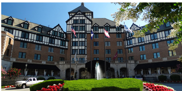
The Hotel Roanoke and Conference Center

You are invited to join Governor Ralph Northam at the statewide Governor's Infrastructure Financing Conference at The Hotel Roanoke and Conference Center, Roanoke, Virginia. The conference is designed to bring together government and private sector professionals in discussions that will help facilitate the planning and delivery of much-needed capital improvement projects across Virginia. The conference is being hosted by Governor Ralph Northam and the Virginia Resources Authority.