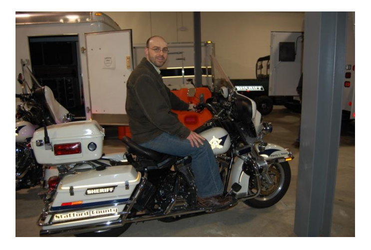
One student tries the bike on for size!