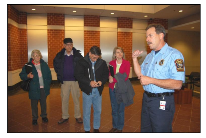
Students are given a tour of Stafford public safety building by Fire and Rescue staff (February 2010).