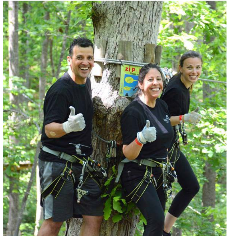
Roanoke County offers a range of family-friendly recreational venues for the entire family, including Explore Park, Green Ridge Recreation Center, an extensive greenway system, and easy access to both the Roanoke River and the Appalachian Trail.

The Human Resources Director supervises a staff of seven, which interacts directly with Payroll and Finance to on-board employees, obtain and provide benefits, and support the departments with changes in personnel.