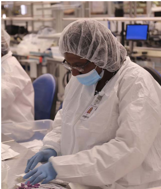
Clean rooms for the assembly and packaging of medical equipment at Roanoke County’s Plastics One facility.

Roanoke County employs approximately 1,020 full time employees, spread out through 21 departments. The departments provide a full range of services to the residents, including an accredited police department, fire and rescue service, planning, zoning, libraries, parks and recreation, and social services. The budget for FY 2019 – 2020 is $196.9 million and the Economic and Community Development budget is $4.8 million. The primary source of revenue for the County is the real estate tax, followed by the personal property tax on vehicles. The County receives significant funding from the state for schools and constitutional offices, but very little revenue from the Federal Government. The Roanoke County Administration Center is located near the intersection of major arterial roads, and near shopping and residential areas. For more information about Roanoke County’s government, please see our website at www.roanokecountyva.gov .