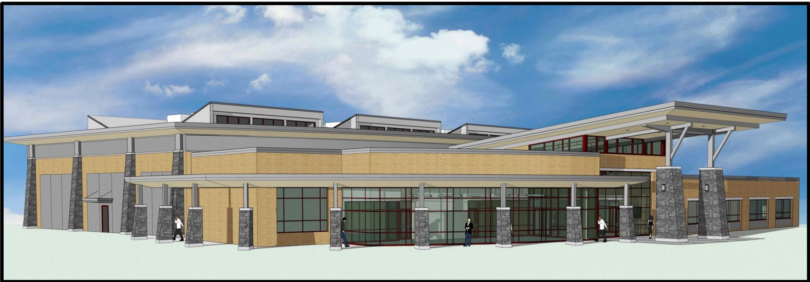
Artist's rendering of Commonwealth Centre for Advanced Training – CCAT