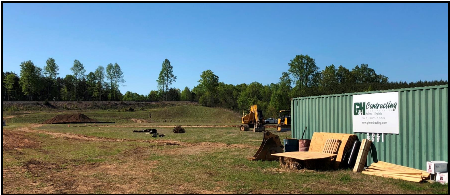
Beginning of CCAT construction – May 1, 2018