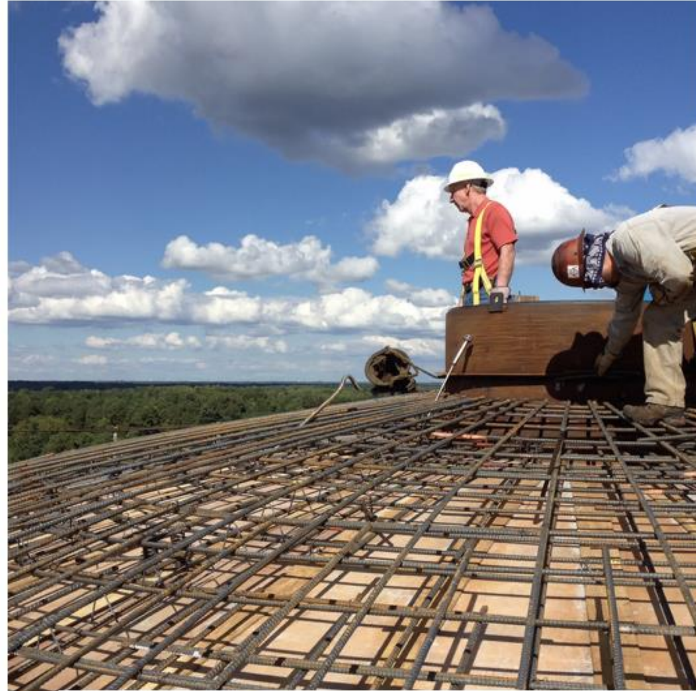
Resources and Assets