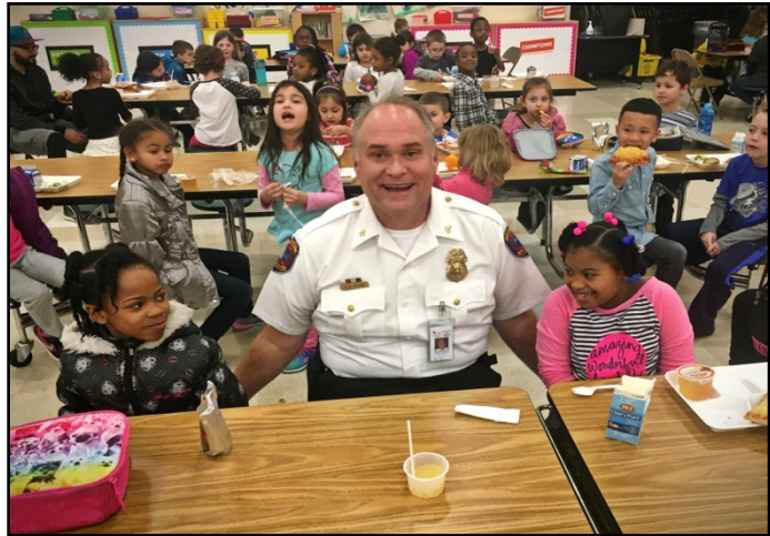
Administrative members of the York County Department of Fire and Life Safety attend the Lunch with a Firefighter program.