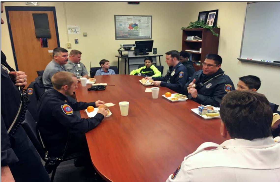
At the Middle School level, York County Fire and Life Safety staff interacts with students in a small-group setting.