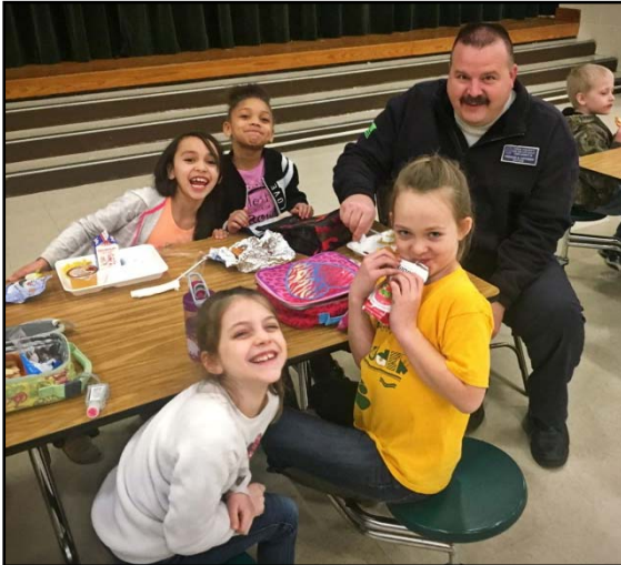
A York County Firefighter has lunch with students at the Elementary level.