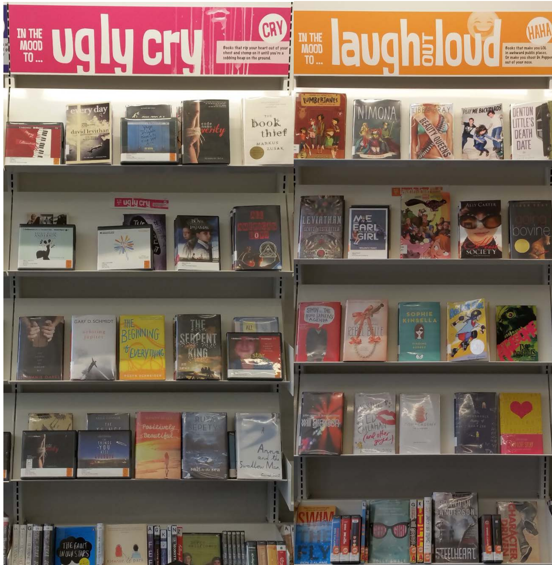
The two most popular Teen Neighborhood Collections.