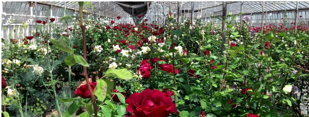
Roses in bloom at Lynchburg Grows