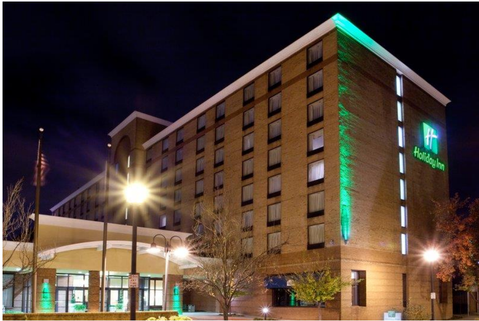
Holiday Inn Lynchburg, 601 Main Street —Lynchburg, Virginia 24504

The 2014 Virginia Urban Agriculture Summit conference will be held in the heart of downtown Lynchburg at the recently renovated Holiday Inn Lynchburg, a perfect location for business and leisure travelers alike. Ideally situated in the heart of this historic city offering beautiful views of the city and the surrounding Blue Ridge Mountains. Restaurants, shopping and entertainment are all within walking distance of the property. With more than 12,000 square feet of meeting space, this location offers a great venue for the summit.