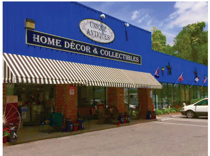
Unique Antiques Mall on Route 301, King George County

Check out Unique Antiques Mall on Route 301 for a wide variety of antiques and collectibles before heading to Oak Crest Vineyards for a wine-tasting experience and maybe an afternoon snack of their delicious cheese and sausage selections.