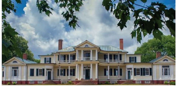
Belle Grove Plantation Bed & Breakfast, King George County

Tour and stay overnight at the historic Belle Grove Plantation Bed & Breakfast on the banks of the Rappahannock River at Port Conway. Birthplace of President James Madison, this plantation offers world class lodging and a central point for exploring the area. Visit the King George County Historical Society & Museum and the Dahlgren Heritage Museum for local history, heritage and culture. Take a picnic lunch and hike the trails at Caledon State Park and Natural Area, a National Natural Landmark known for its old growth forest and home to one of the largest concentrations of American bald eagles on the East Coast.