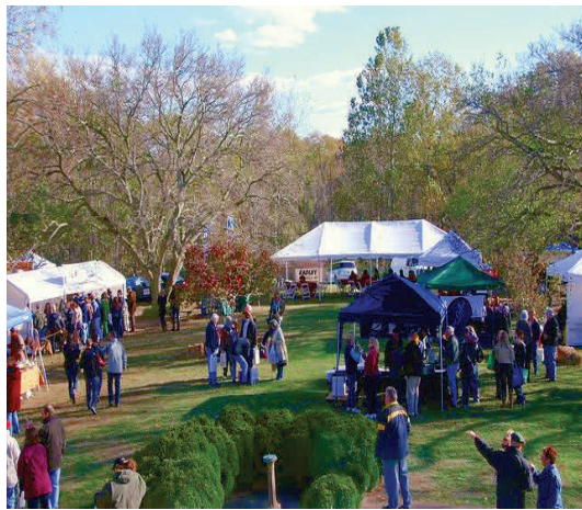
Caledon Art & Wine Festival, Saturday November 7, 2015 at 10am, King George County