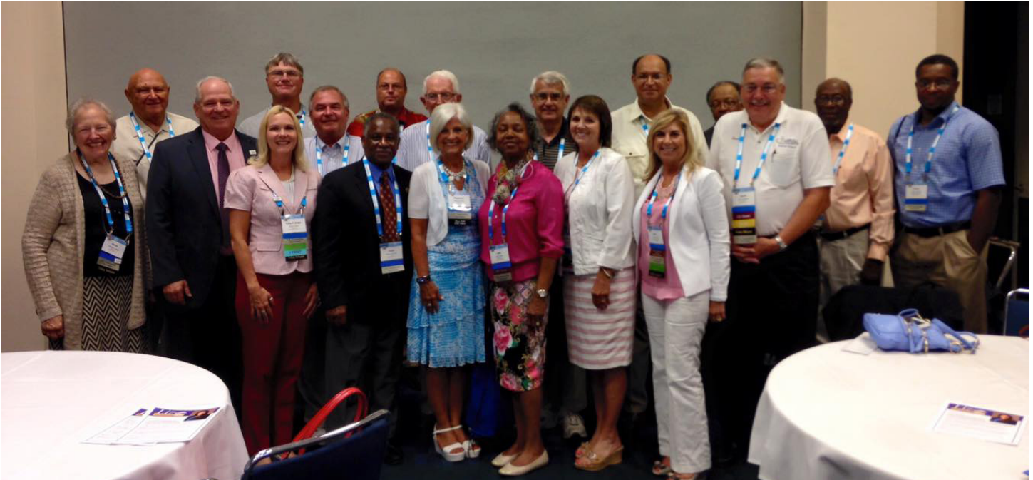
Virginia was well-represented by elected officials at the NACo Annual Conference this past week. VACo thanks you for your service and looks forward to many more years of working together.