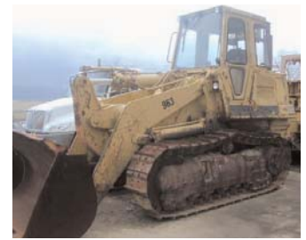
1990 Cat Front End Track Loader generated 55 bids and sold to a bidder in Tennessee for over $47,000 - over 460 miles away.

GovDeals, Inc. (www.govdeals.com) provides online auction services for Counties, Cities and State governments and agencies to conduct online sales of their surplus vehicles, equipment and other property over the Internet. Currently over 2,485 governments nationwide have adopted GovDeals’ online sales solution. GovDeals is a wholly-owned subsidiary of Washington, DC-based Liquidity Services, Inc.