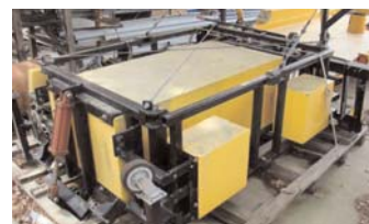
Alpha 100K Truck Mounted Attenuator made by Energy Absorption Systems, Inc. Generated 43 bids and sold to bidder in New York for over $7,500 - over 360 miles away.