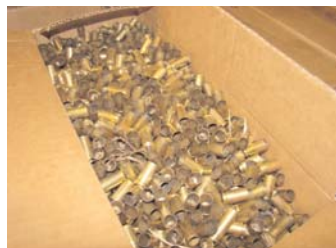
Once Fired Mixed Pistol and Rifle Brass. Approx. 3,800 lbs. in 152 Boxes. Generated 49 bids and sold to bidder in Arizona for over $5,000 - over 2,300 miles away.