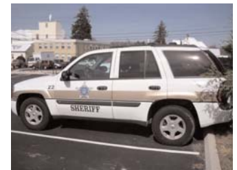
Two 2003 Chevy Trailblazers generated 74 bids and sold to a bidder in California for over $9,500. Purchaser bought vehicles to be used in Motion Pictures.