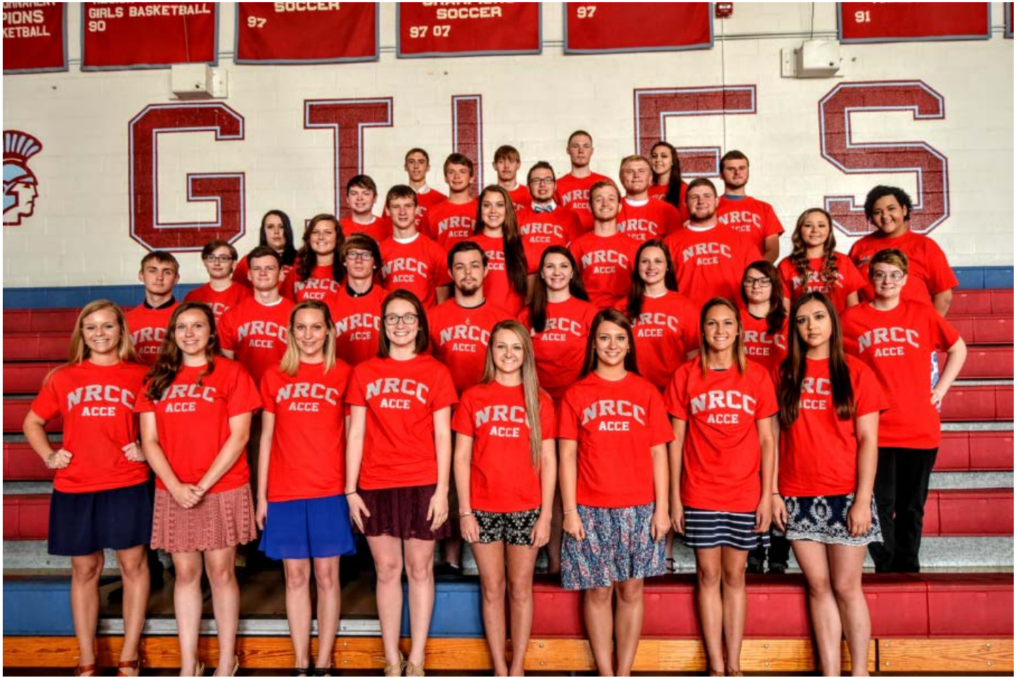
2016 Giles Senior Graduates Participating in A.C.C.E.