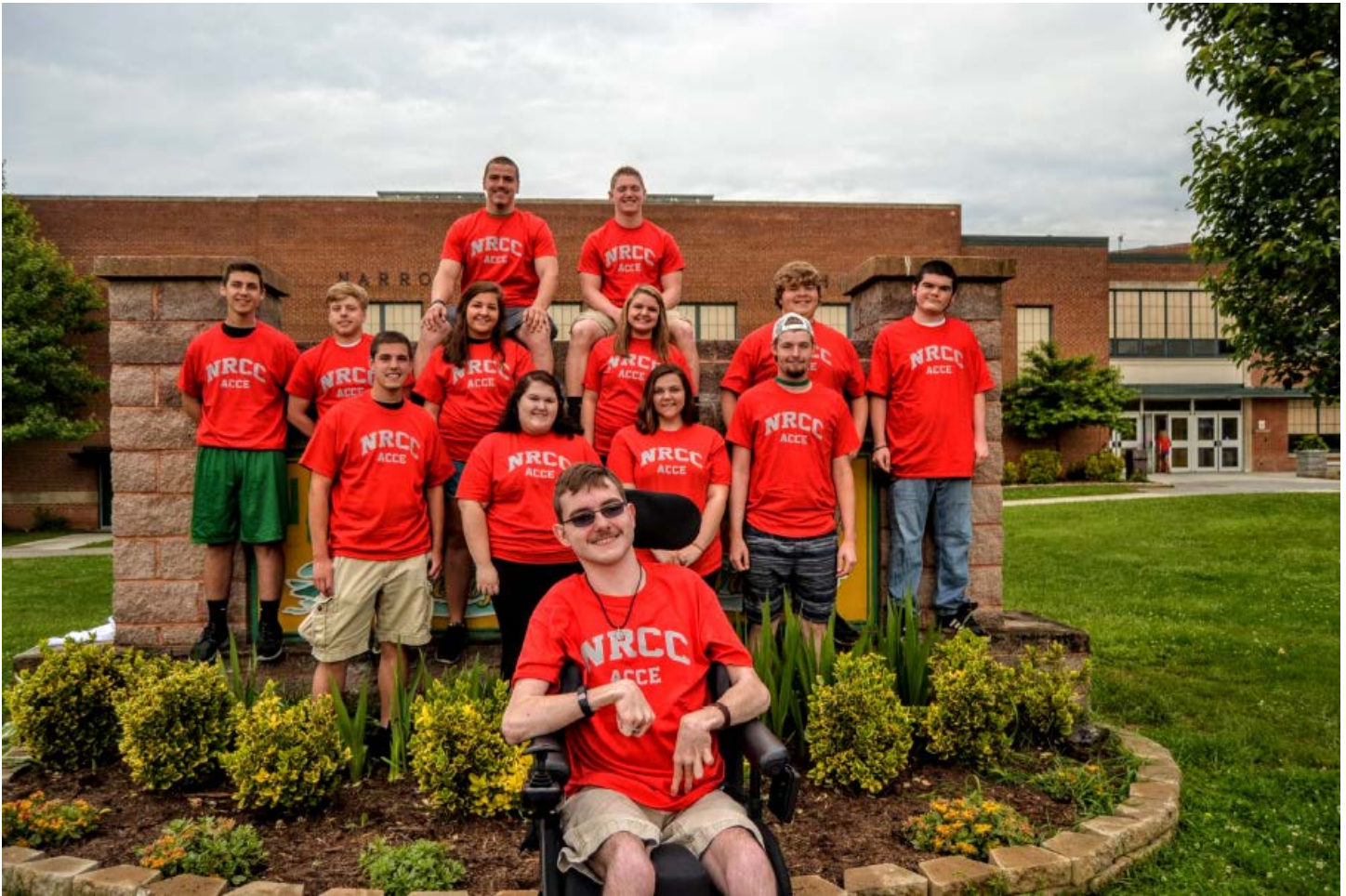
2016 Narrows Senior Graduates Participating in A.C.C.E